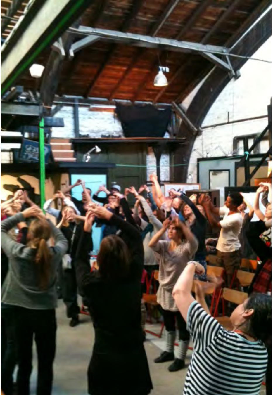
Rounding Up Dance.