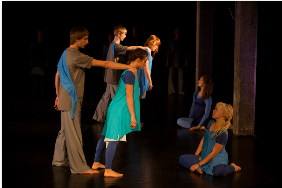
Photo 1: Rehearsal for Dancing Whirlpool at Theater Kiusu, Outokumpu in October 2013.

was to begin a new collaboration called Dancing Whirlpool, a co-production with the dance department of the Karelian College of Culture and Arts, funded by the Karelia European Neighborhood and Partnership Instrument, cross border cooperation (ENPI CBC). This project was a continuation of several collaborations since 2007 between the dance programs of Petrozavodsk and Outokumpu. During the past seven years various events have taken place: teacher exchanges, performance visits and even a dance festival organized together. This time, though, the task was more ambitious than before. In addition to a teachers' exchange, it included constructing a full-length performance together with the teachers and students from both colleges. The piece was performed in Karelia of both Russia and Finland.