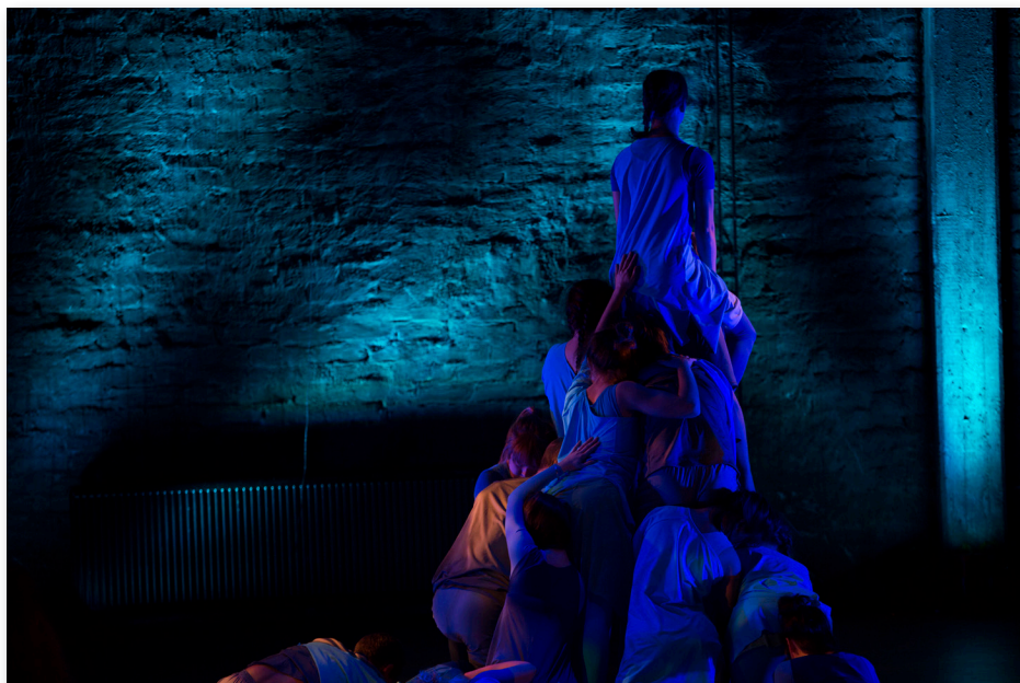
Photo 4: Performing Dancing Whirlpool, October 2013, at Theater Kaisu, Outokumpu.

and sound/light/costume design), gender issues (having a same-sex couple dancing together/ tolerating only male-female partnering), or the notion of abstract versus narrative dance, triggering the question of what is the meaning of a movement, or furthermore, what is the meaning of dance. And moreover, what is the meaning of what we were doing. It was not always easy to find an agreement, resolution or even compromise in the process, but more important than the end result were the collisions themselves. Forcing us to confront our core values regarding the work, they served as a space for the actual exchange, for the real meeting of the cultures, where we could question our own values and thinking processes. If the universal language of dance is the common love that binds and inspires us in collaboration, instead of collaboration being an end in itself, its function could be seen as a to guide us to unknown territory, confronting and reflecting on our cultures and values from deeper within.