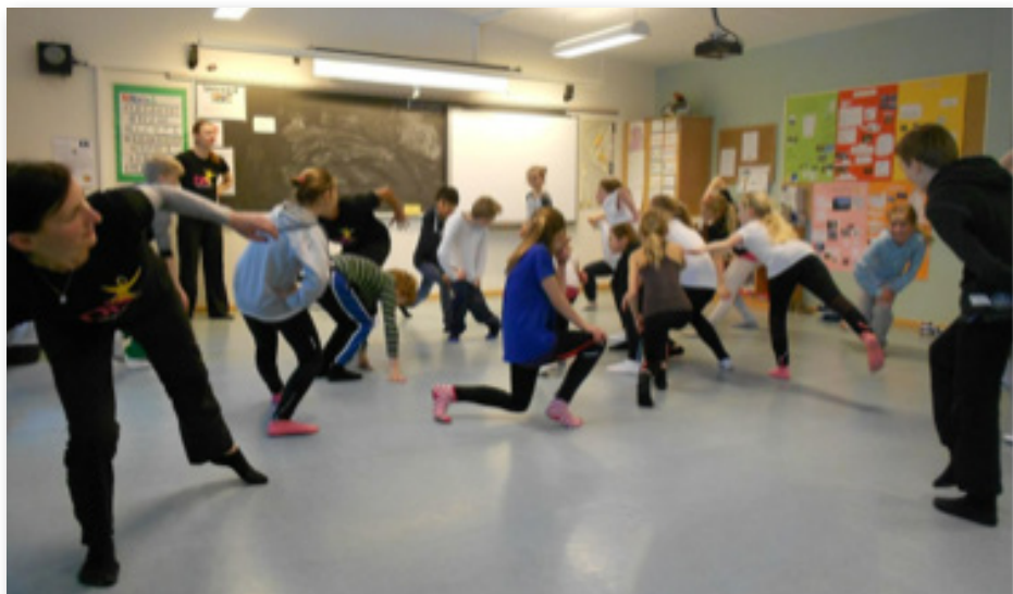
Photo 1: Creating various figures or shapes in the creative dance session.

We selected which schools we would offer the workshop to on the basis of our knowledge of socio-economic factors in the environment, cultural background of pupils and/or parents and the schools' pedagogical methods. We gave an identical questionnaire to the pupils before the workshop (2-7 days) and immediately after the workshop, in order to document level of knowledge, expectations and effect of the workshop. The questionnaire had questions like: What dance forms do you know? Have you had any dance training? Do you like to dance? Why/ why not? If you dance: when and where, and in what context do you dance? Do you think there should be dance in schools? Why/ why not? Etc.