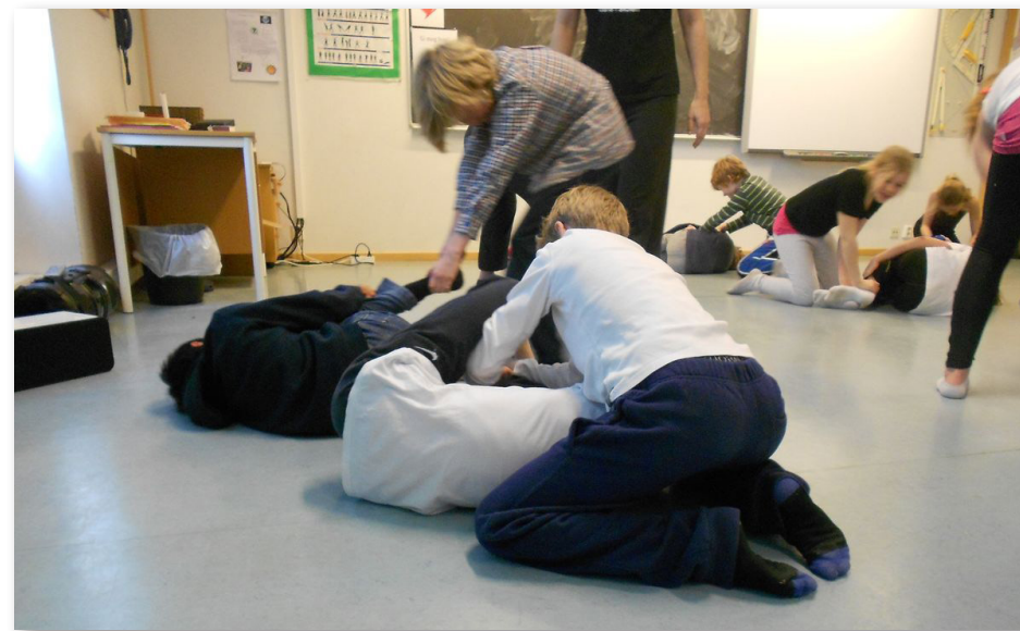
Photo 2: Exploring effort in the creative dance session.