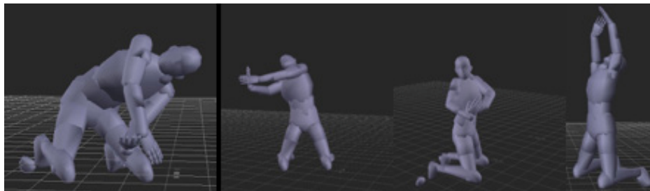
Figure 1. Screenshots of the 3D animation of the dance.